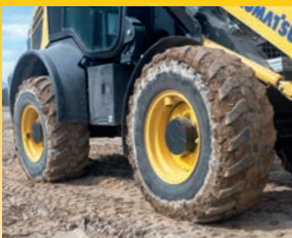
100% manual locking differentials front and rear (option)