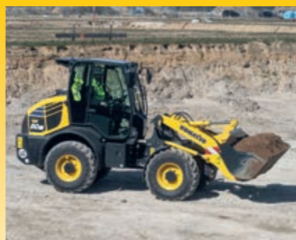
Electronically controlled suspension system load stabilizer (ECSS) (option)