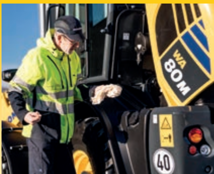
Fast, easy and comfortable access to daily inspection points