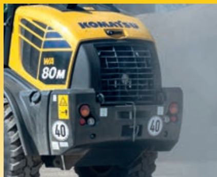
Wide core radiator with (optional) reversible fan