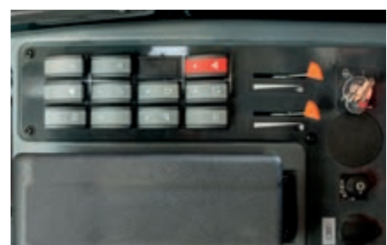
Improved, ergonomic control elements