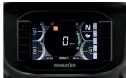
Large multi-function monitor

The user-friendly multi-function colour monitor with Equipment Management and Monitoring System (EMMS) supports safe and smooth work. Eco-gauge and an Eco guidance with active recommendations help maximising fuel savings. The monitor is conveniently customisable with a choice of 24 languages.