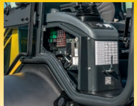
Side cover for quick maintenance access