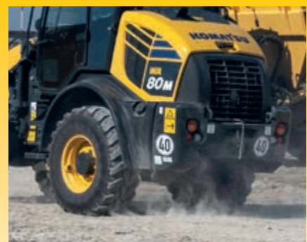
40 km/h limited hydrostatic driveline (option)