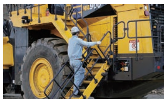
Power ladder (optional) provides safer access and egress.