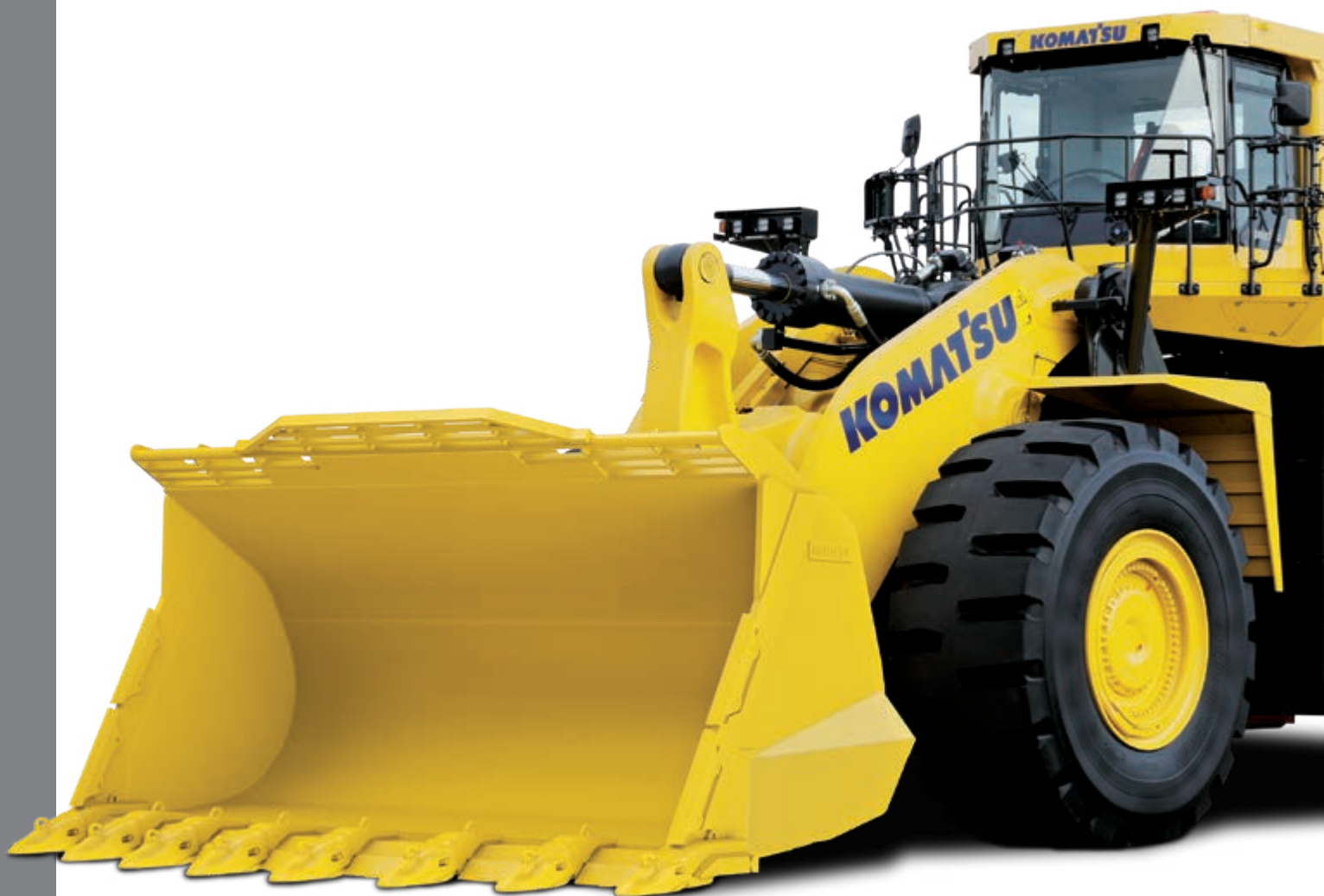
Image may display optional equipment or specifications not available in your area.