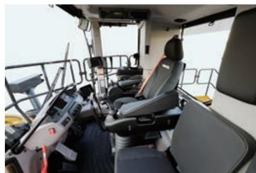
Completely redesigned cab and new, air-suspended operator seat with integrated EPC and Advanced Joystick Steering System lever consoles