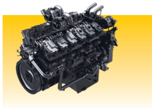
The Komatsu EU Stage V engine is productive, dependable and fuel efficient.